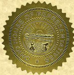
JASON STEPHENS SPEAKER OHIO HOUSE OF REPRESENTATIVES